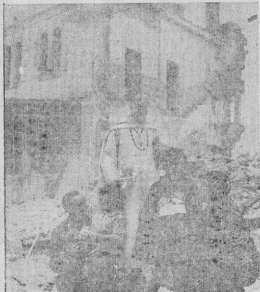
Dos representantes de las fuerzas armadas de los Estados Unidos ofrecen a las huérfanas de un convento católico bárbara e inutilmente destruido por la aviación nazi, dos mil dólares que fueron colectados entre soldados y marinos para subvenir a sus urgentes necesidades.