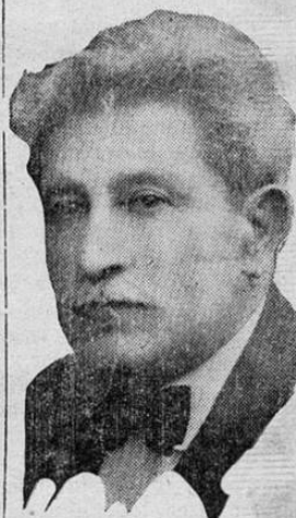
DR. RAFAEL CALDERON M., declarado por el Congreso Nacional Benemérito de la Patria

LA VOZ ATLANTICA se une al homenaje nacional que se hace al distinguido ciudadano, y al médico eminente.