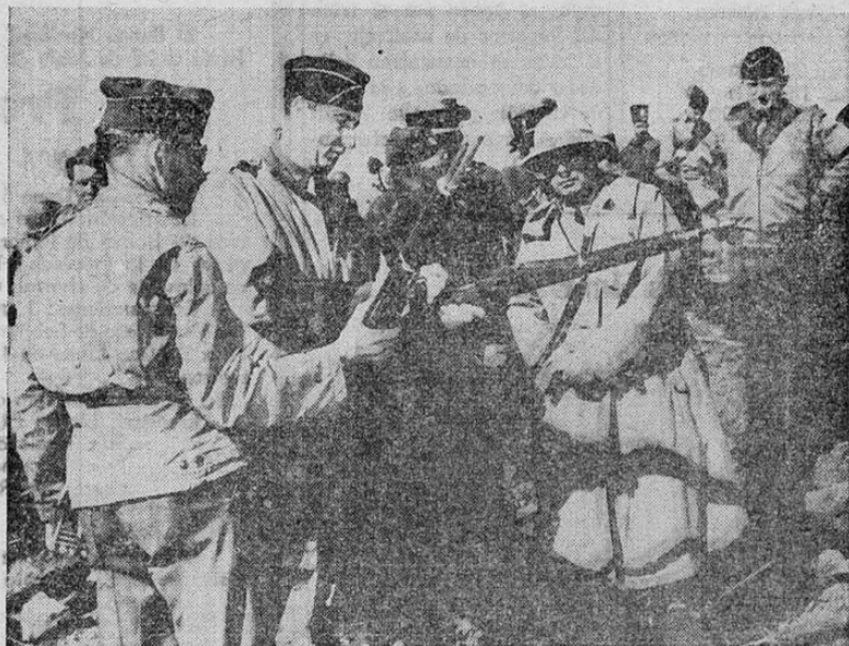
El teniente general Mark W. Clark (el segundo de izquierda a derecha), uno de los victoriosos jefes norteamericanos de la campaña de Túnez, explica el funcionamiento de los modernos rifles del ejército de los Estados Unidos al general Eduardo Gomes (con sombrero tropical), comandante de las fuerzas aéreas del norte del Brasil, en visita a los campos de batalla tunecinos.