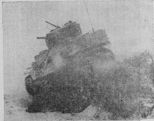
Ultramoderno tanque ligero norteamericano que ha demostrado ser en los campos de batalla superior a cualquiera otro del mismo tipo. Es muy rápido, está dotado de gran maniobrabilidad y tiene una extraordinaria potencia ofensiva.